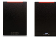
ESR40 and ESRP40